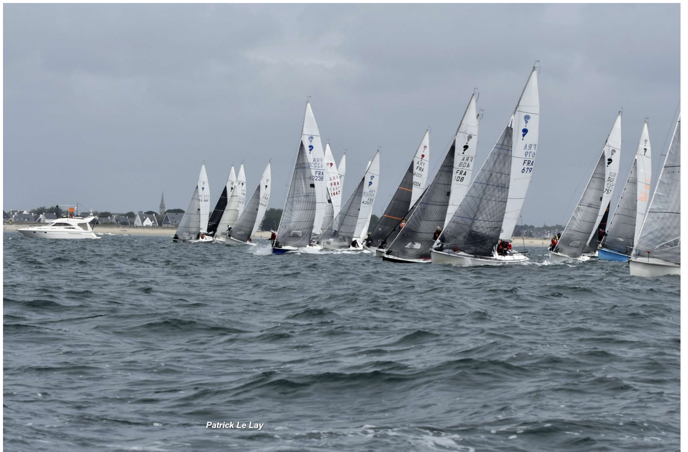
Patrick Le Lay